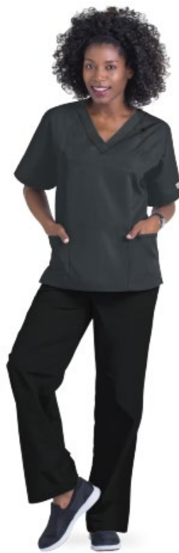
MATERIALS MANAGEMENT SUPPLY SUPPORT Pewter scrub top, Black pants

AdventHealth's uniform policy defines “Core uniforms” as items that are required and are intended to reflect consistency throughout a department.