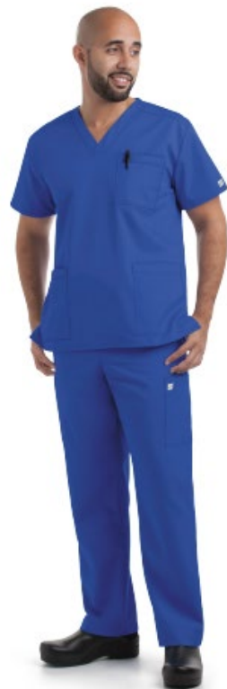
LPN / LVN West FL Royal Blue scrubs