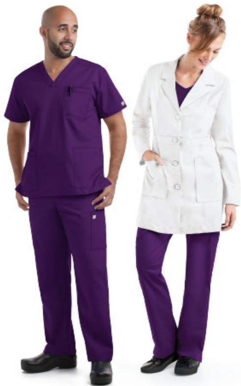
LAB Eggplant scrubs, or Eggplant scrubs with White lab coat